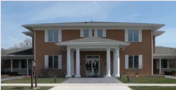
DMS was instrumental in bringing the Hines Fisher House of Illinois to the Chicago-land area.