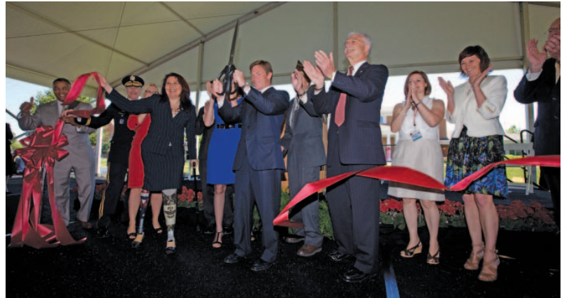
Celebrating the “Cutting of the Ribbon” during the Open House celebration.