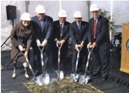
Groundbreaking ceremonies took place in 2005.