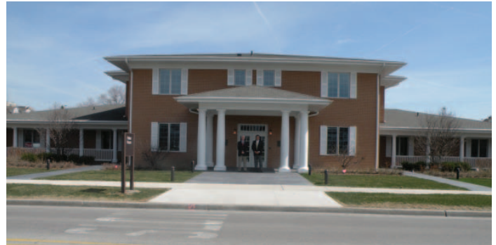
The newly completed Hines Fisher House of Illinois.